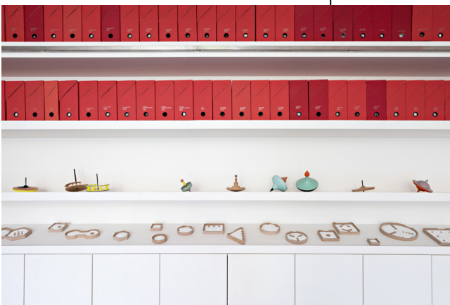
7 Céline Condorelli