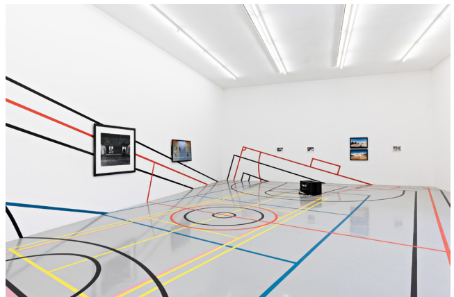
4 Céline Condorelli