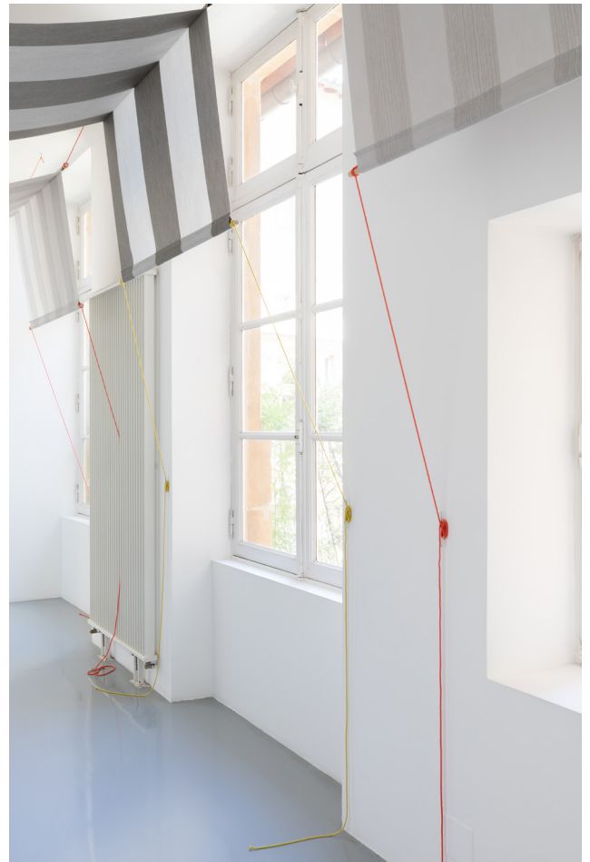
8 Céline Condorelli