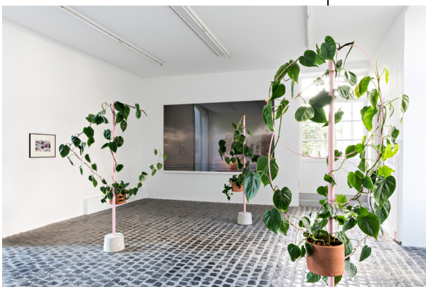
3 Céline Condorelli