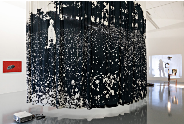
5 Céline Condorelli