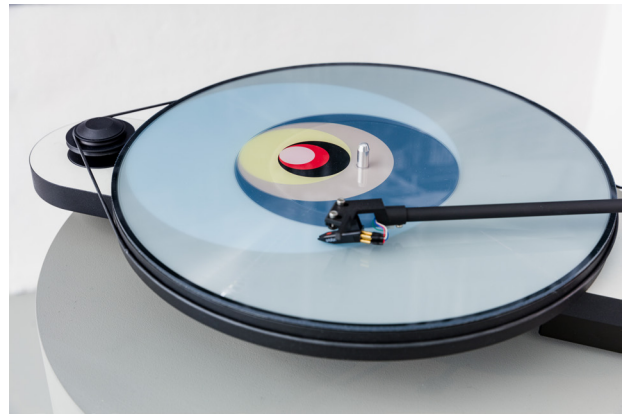
2 Céline Condorelli