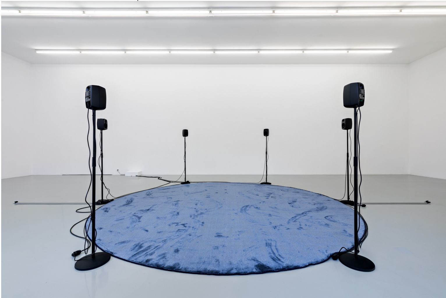
Hanne Lippard, Anonymities , 2017 Expositions Le Langage est une peau , septembre 2021 - février 2022 49 Nord 6 Est-Frac Lorraine, Metz.

Language is a Skin puts in play the disobjectification of the artwork as much as that of the feminine body, in the time of a fourth wave of feminism. Through the display of our own planned obsolescence, Hanne Lippard invites us to rethink the exhibition as a utopic space, that of a possible emancipation in the face of a world in which a voice must be given.