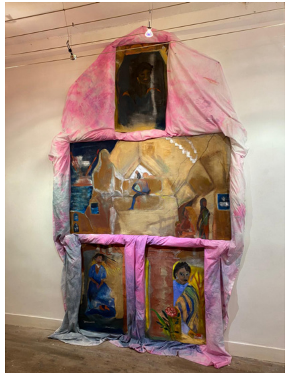
5 Inès Di Folco