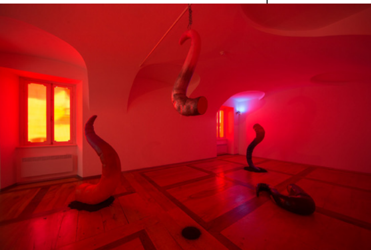
Tarek Lakhrissi This Doesn't Belong to Me , 2020, Vue d'installation, Palazzo Re Raudebengo, Guarene (IT)