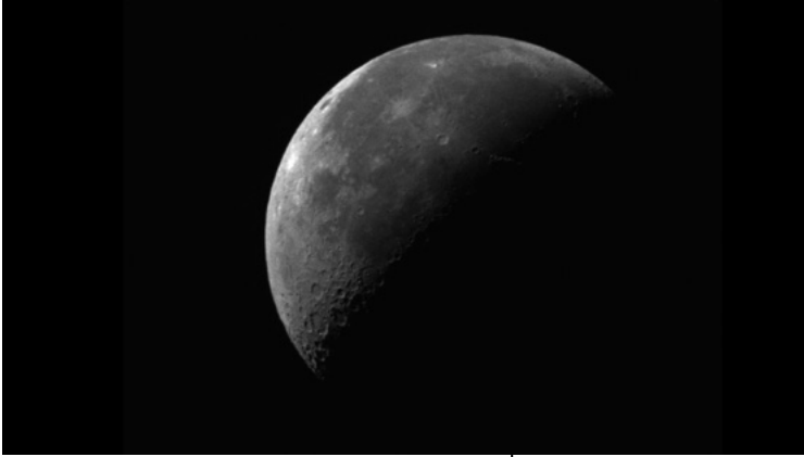
6 Tabita Rezaire