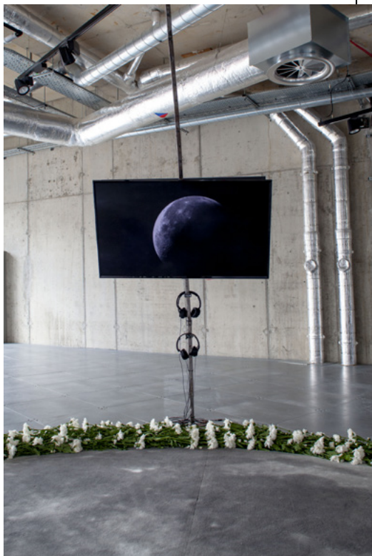
Tabita Rezaire, Satellite Devotion , 2019, Vue d'installation, Arebyte Gallery, Londres

A singularity of practices that train, stun, avenge, hybridize/debride, and wrap (us) — carefully? Anyway, what interests me there, and above all here, is to find back that hazardous humility of a title that reminds perhaps that no matter how badly we (expect / wanna / are able / care) ) to share anything : still, it remains an exorable effort , that of learning to expose/exhibit oneself to the many, without demands but in spite of, and despite, all. Nevertheless , understood that in our hoods : we burst all our exhibitions to song, with others.