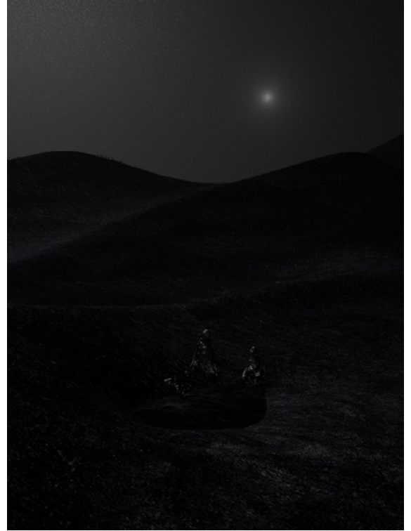
4 Nicolas Pirus