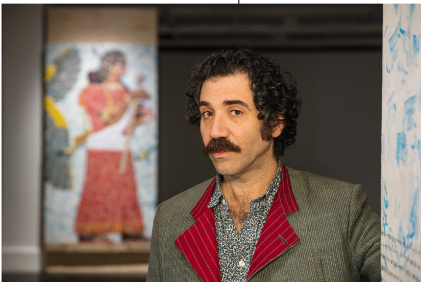
6 Michael Rakowitz