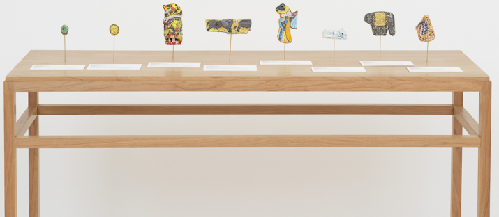
Michael Rakowitz, The invisible enemy should not exist (détail), 2018.

Michael Rakowitz's exhibition contributes to an ongoing investigation on the itinerancy and contingency of artworks; in this context, Rakowitz's practice eloquently delineates the transformative potential of diasporic realities. It fulfils an urgent need to invest the discipline of art history with an ethical rethinking between the links between past and present and to ask: who has access to history? And to what history? It also points towards new ways in which links between cultures and contexts can be formed.