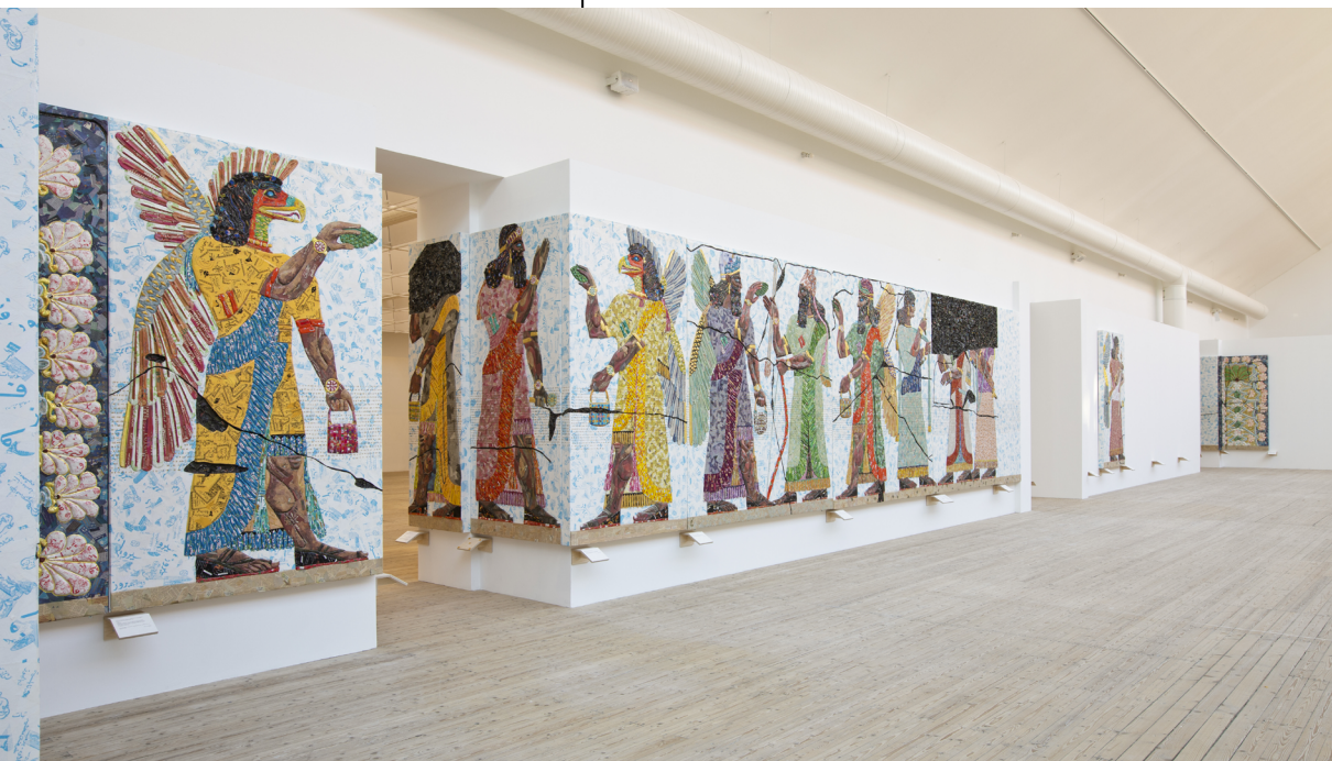
Michael Rakowitz, The invisible enemy should not exist (Room G, Northwest Palace of Nimrud), 2019.